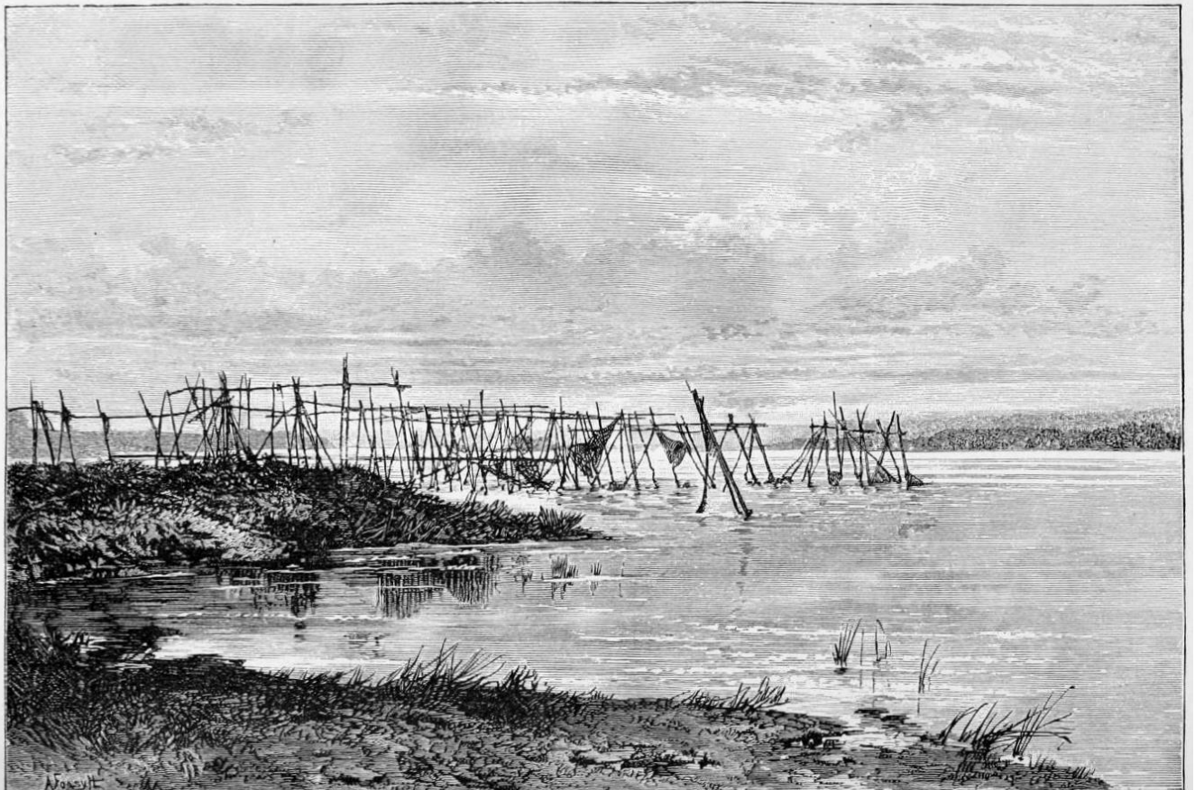
SCENE FROM THE COVELET NEAR OUR STATION AT STANLEY FALLS. THE SEVENTH CATARACT IN THE DISTANCE. (From a photograph.)

skinny forefinger beckoned me into the sanctuary. Its light was dim, and a heavy writing-desk squatted in the middle. From behind that structure came out an impression of pale plumpness in a frock-coat. The great man himself. He was five feet six, I should judge, and had his grip on the handle-end of ever so many millions. He shook hands, I fancy, murmured vaguely, was satisfied with my French. BON VOYAGE.