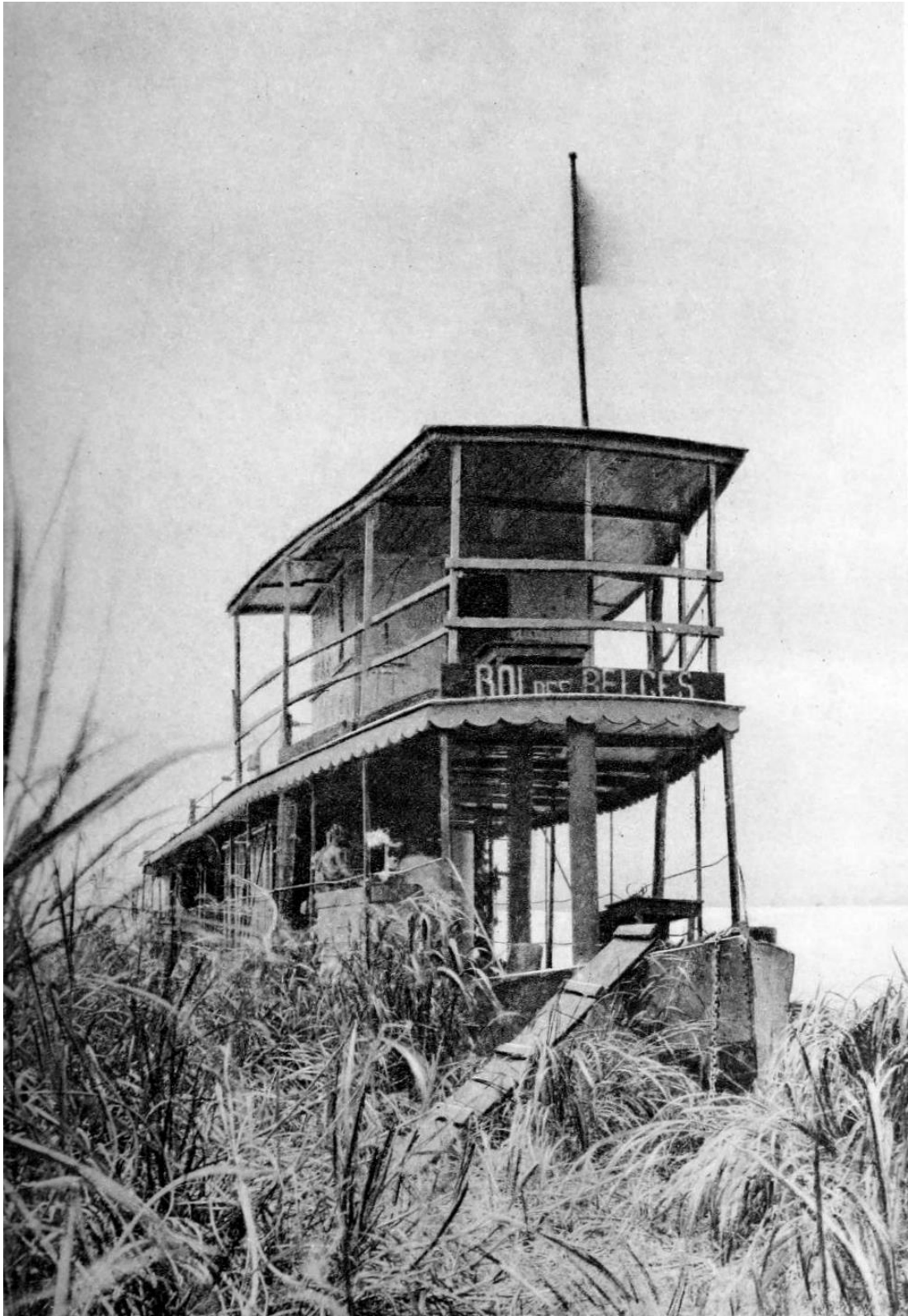
The Roi des Belges (franc. "Król Belgów"), belgijski statek rzeczny, dowodzony przez Conrada w górnym biegu rzeki Kongo, 1889.